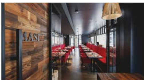
GERMANY Masi Wine Bar Munich