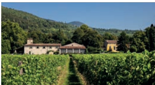
VALPOLICELLA Possessioni Serego Alighieri