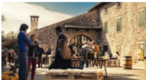
LAZISE DEL GARDA Masi Tenuta Canova