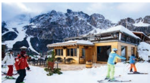
CORTINA D'AMPEZZO Masi Wine Bar Al Druscié