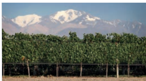
ARGENTINA Masi Tupungato