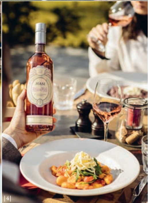
1. A wide courtyard and beautiful view over the vineyards 2. Deep in the countryside of Lake Garda, Tenuta Canova has over 40ha vineyards 3. The complete range of wines from the Masi Group is available in the Wine Shop 4. The 'Vino e Cucina' Wine Bar offers wines to pair with food based on regional cuisine