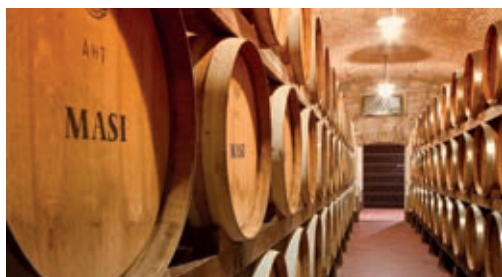
VALPOLICELLA Cantine Masi